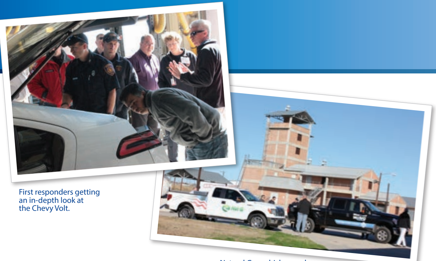
Natural Gas vehicles used during first responder training.