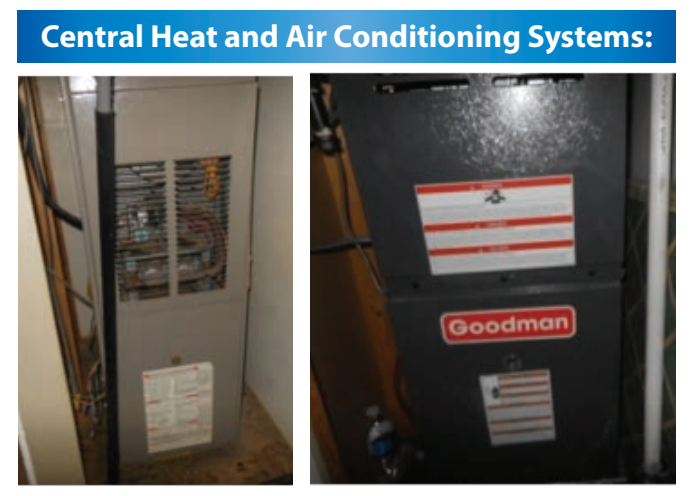
Before – Old poorly functioning unsafe unit

After – New panes keep the home properly sealed