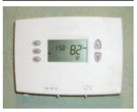
After – Digital Programmable Thermostat to set temperature to maximize energy efficiency