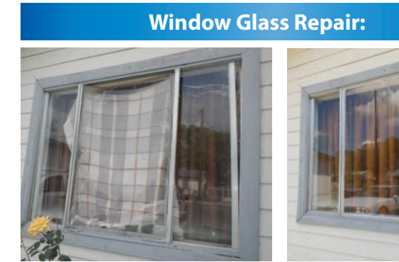
Before - Broken window let hot/cold air through

After - Insulation added to create thermal barrier